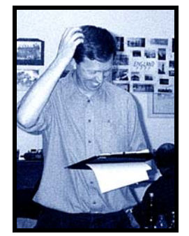
The Quizmaster in a quandary