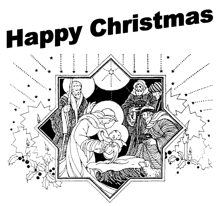
To you all With Best Wishes for the New Year From the Editors and the Parish Council.