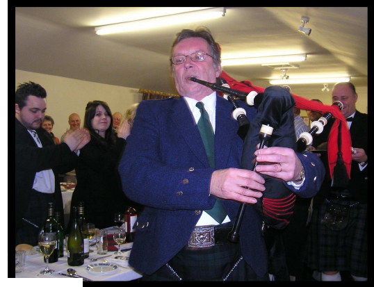
Piping in the Haggis