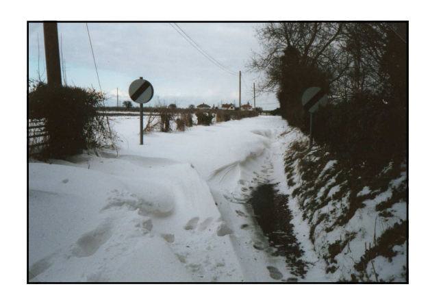
Rogues Lane 1996