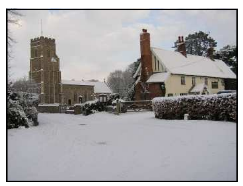
Printed by Sharward Services Westerfield