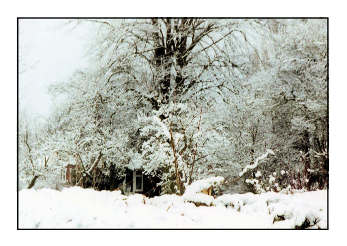
A garden 2001