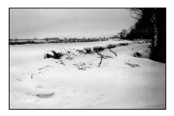
Thong Hall Road 1987