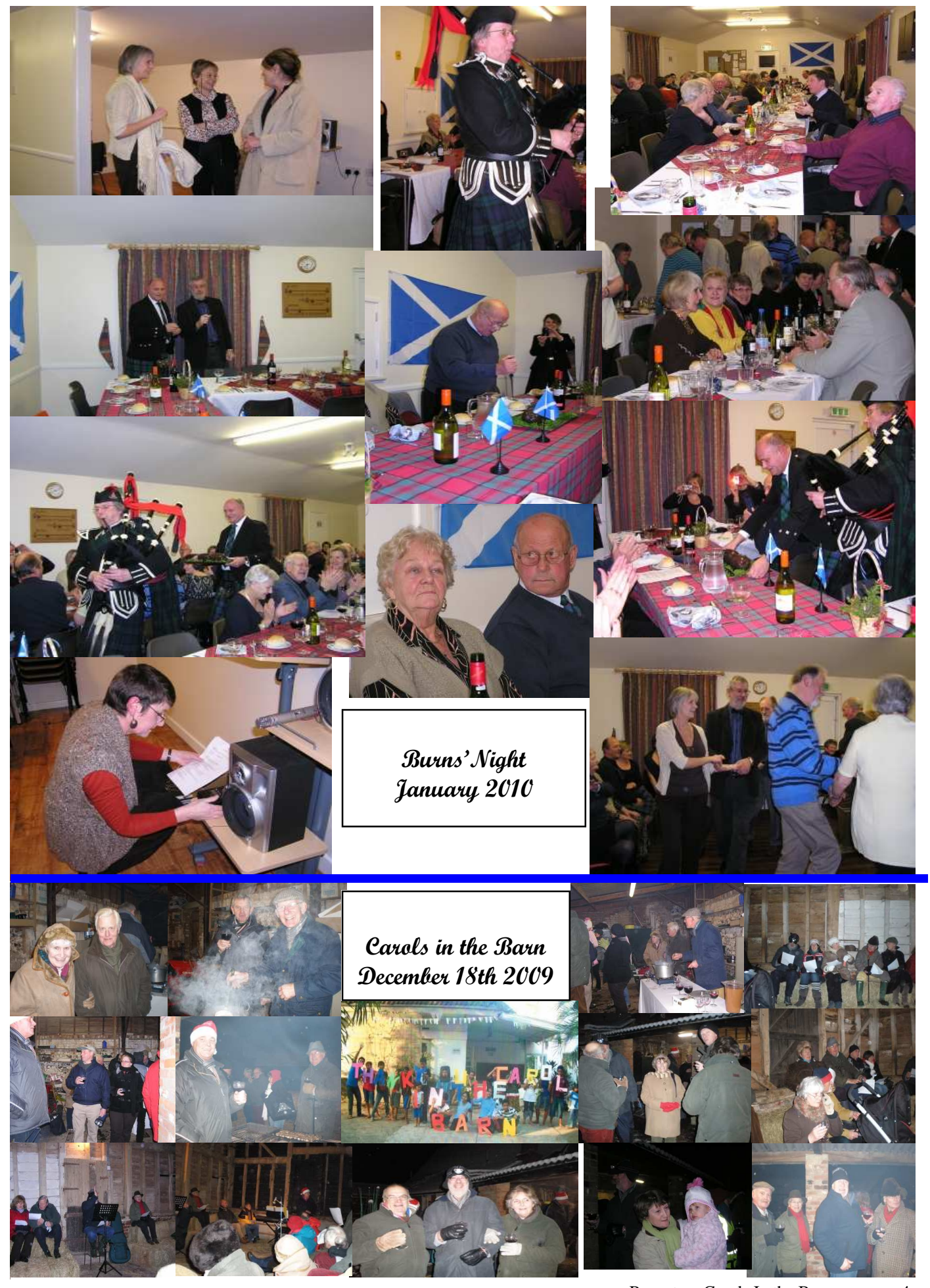
Report on Carols In the Barn see page 4