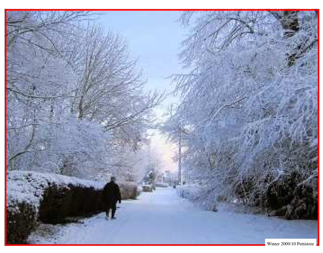
Best Wishes for a Happy Christmas and a Very Prosperous New Year To all our Readers and Contributors from the Parish Council and Editors