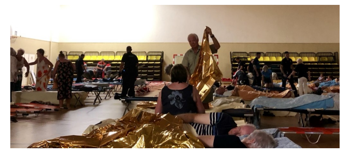
Setting up the bedding.