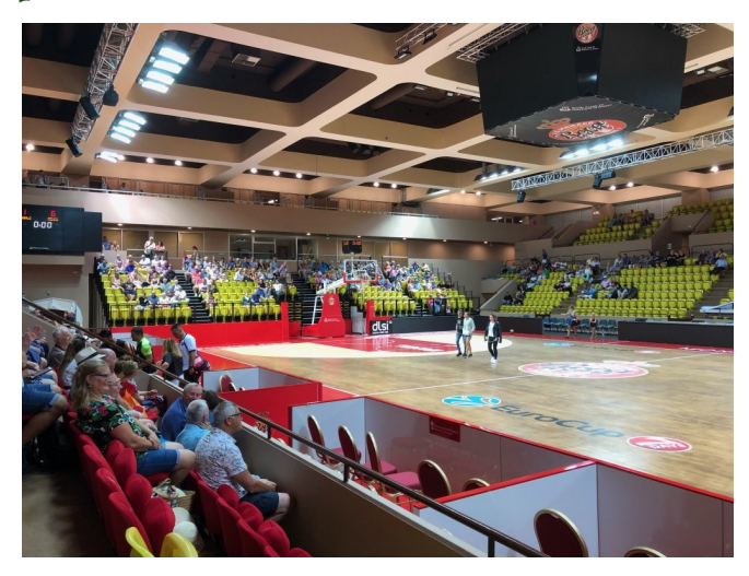
The Monaco Basketball Stadium