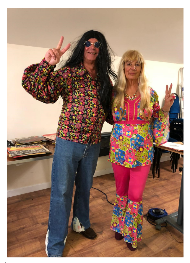
(Ed: Pleased to know they have "grown out" of their adolescence and "come good").

On Saturday 16 November villagers and friends gathered in the village hall armed with their vinyl LPs, 45s and 78s. Vinyl records which are experiencing a real revival and outlets like HMV sell modern LPs. I understand cassette will be next! Most of the charity shops stock both 45s and LPs. A record player (unfortunately not a Dansette ) was set up and some of us, dressed in 60s and 70s gear, turned the clock back several decades.