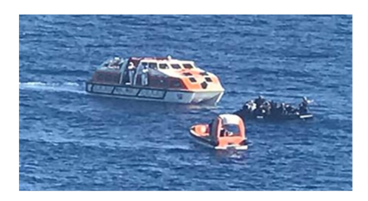
Migrants, rescue boat and tender (lifeboat)

All went according to plan with a day spent in Jerez sampling sherry and enjoying a performance at the Spanish Riding School. However when we were sailing through the Straits of Gibraltar the Captain announced that a boat in distress had been spotted. Luckily the weather was good so we watched from our balcony as the ship's lifeboat was launched and proceeded to collect 17 people from a rubber boat. The crew obviously had a well-rehearsed drill of taking one person at a time off the rubber boat. Each one took about 10 minutes presumably while they checked them over for weapons and health before getting the next man. Our ship then had to rendezvous with a Spanish Coastguard cutter and the men were transferred to that. We lost half-a-day of the cruise which meant a reduction in our time in Barcelona, but as the Captain said when thanking the crew and passengers, 18 lives were saved that morning.