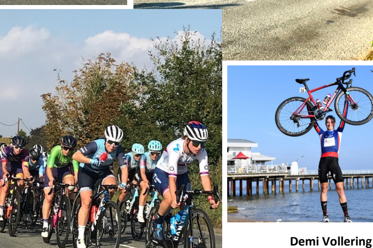
A J Bell Women's champion 2021